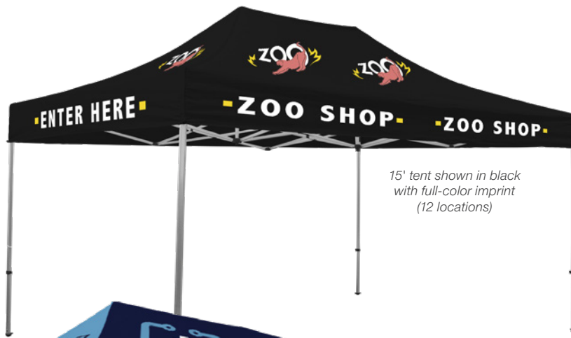
15' tent shown in black with full-color imprint (12 locations)