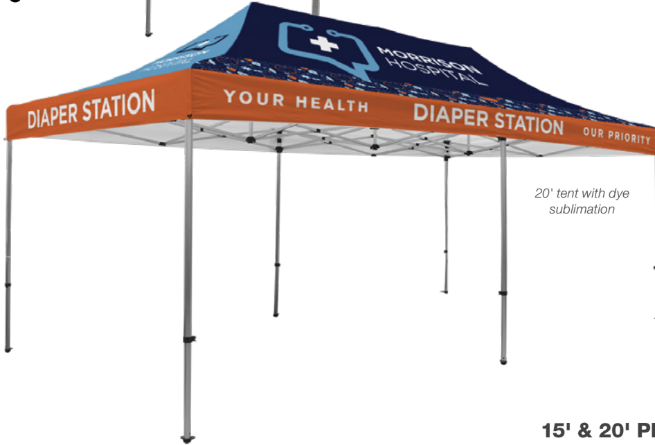
20' tent with dye sublimation